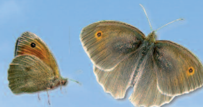
Meadow Brown 50-55mm

The Comma's name comes from the comma shaped marking on the underside of its wing.