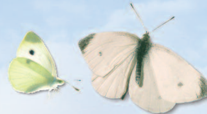
Small White 48mm

The Red Admiral used to migrate from Africa but now lives here due to climate change.