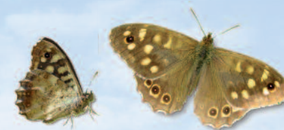
Speckled Wood 47-50mm

Blue spots on wing edges are a key difference between Small Tortoiseshell and Painted Lady.