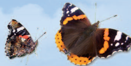
Red Admiral 67-72mm

Because the Meadow Brown caterpillar feeds on many different grasses, this species can be found in many places.