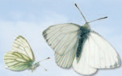
Green-veined White 50mm

The Holly Blue is the only blue butterfly found in our gardens; the caterpillar feeds on Holly and Ivy.