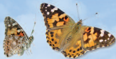
Painted Lady 64-70mm

The Peacock flashes the eye-spots on its wings to stop birds trying to eat it!