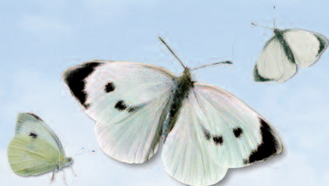
Large White 63-70mm

The Painted Lady arrives here every year after flying all the way from Europe.