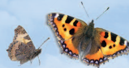
Small Tortoiseshell 50-56mm

Only the male Orange Tip has orange tips. The female is white all over, but both have green camouflage underneath.