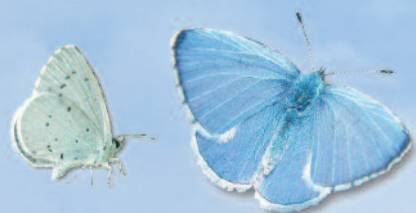
Holly Blue 35mm

This guide only covers the most commonly occurring garden butterflies. If you see any other species or would like to know more about how to encourage butterflies, please visit www.butterfly-conservation.org